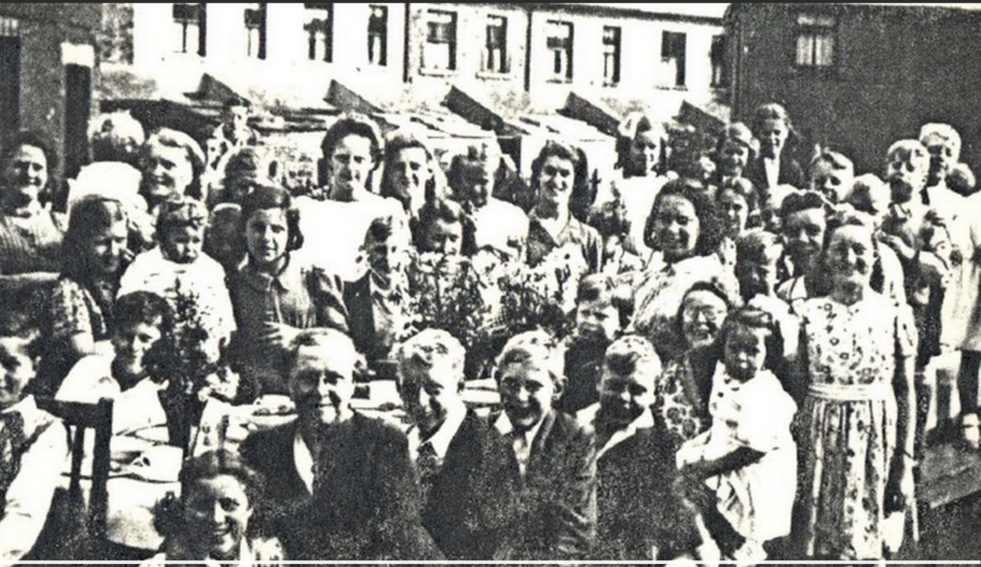
VE Day in Rossendale in 1945- street party in Haslingden