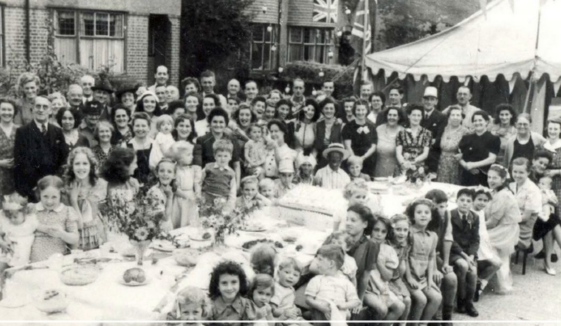
VE Day in Rossendale in 1945- street party in Bacup