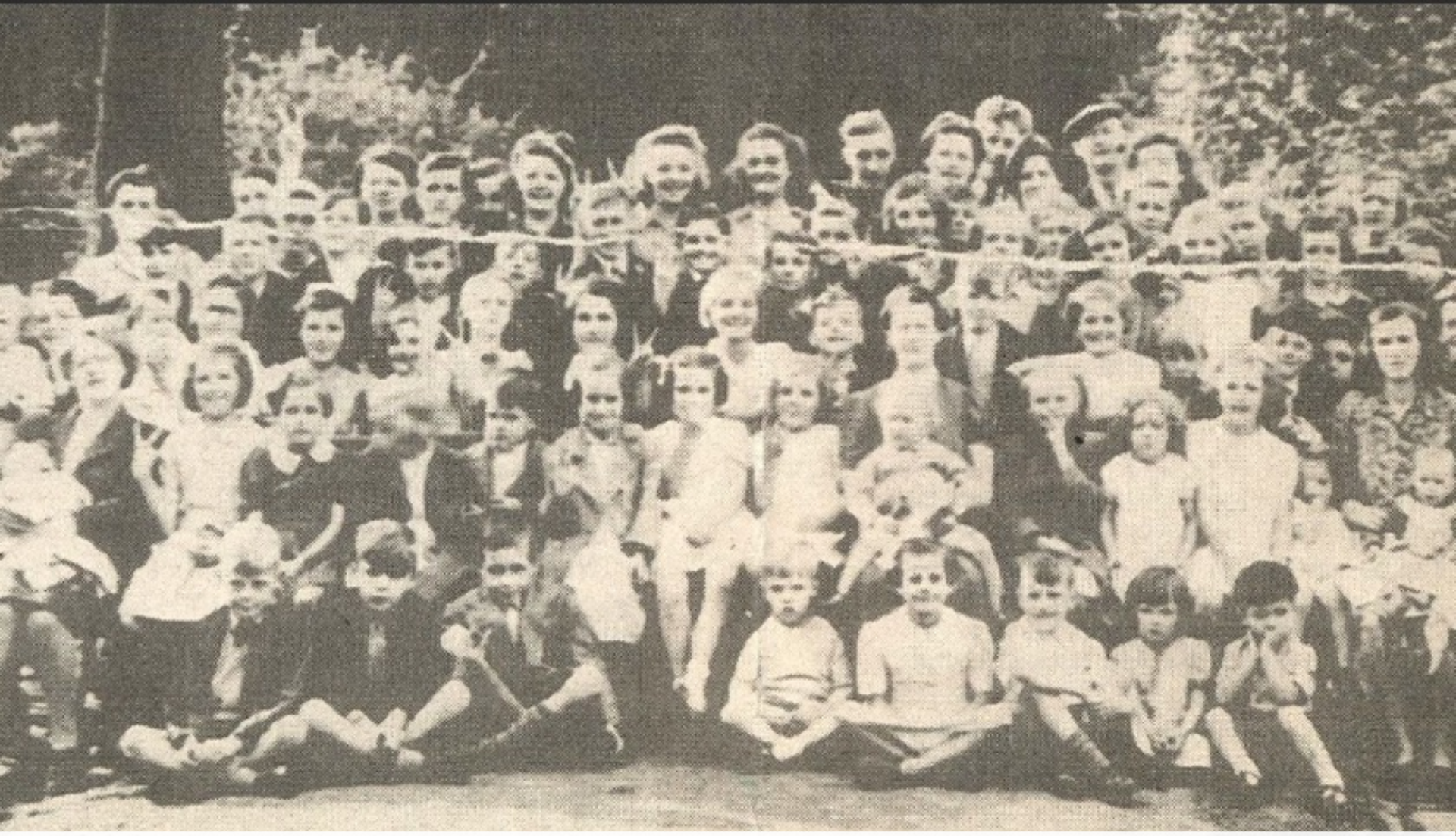
A street party in Helmshore, Rossendale